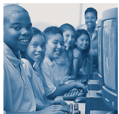
A TOOLKIT for College Students Volunteering with K-12 Youth